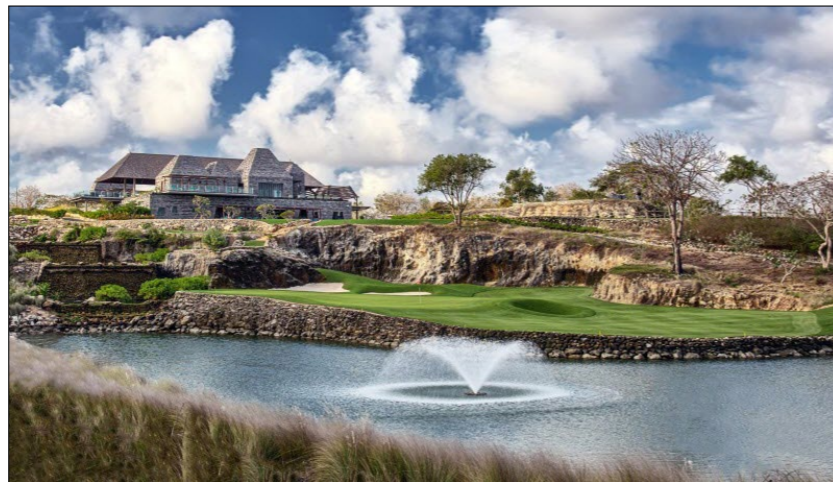
The 18th hole at Bukit Pandawa Golf & Country Club in Bali

"I believe that one of golf's strongest growth markets lies in the creation of courses that can be played in relatively short time frames while providing a non-intimidating experience for young and beginning golfers. Bukit Pandawa is an example of beautiful golf design applied to a non-traditional layout."